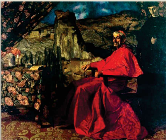
The Cardinal, 1912, 201x236 cm

Zuloaga was one of the most sought-after portraitists of the 20th century. With his portraits of personalities from intellectual and artistic circles and of important families from all over Europe, North and South America, which he created over decades, he celebrated international success. His portraits met a need for representation that could not be satisfied by photography. They secured him considerable income, as the average price of a Zuloaga in the 1910s was 15,000 dollars.