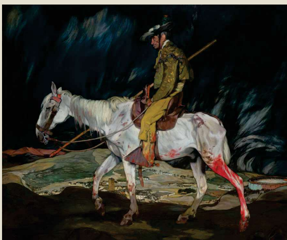
The Sacrifice of the Fiesta, 1910, 284×344 cm

As early as 1889, the young Zuloaga, who was born into a respected Basque family of artisans, moved to Paris – at that time the international centre of the art world. Inspired by the scene there, he created café and street scenes as well as his first naturalistic portraits. The French capital was an important constant in Zuloaga's life, a place to which he returned again and again. He was well connected not only in the bohemian world, but was also friends with the big names of the cultural scene such as Auguste Rodin, Henri de Toulouse-Lautrec and Maurice Ravel. During his numerous stays in Spain, however, he also