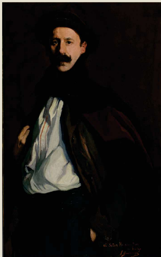
Self-portrait, 1908, 112 × 71 cm

In 1898, Zuloaga's move to Segovia marked the beginning of his most important work period with paintings depicting a conservative Spain: In Segovia and its surroundings, he created depictions of the harsh, barren landscape and its archetypical people. These scenes contributed decisively to the spread of the Castilian myth. Castile, which embodied the historical origins of Spain, was elevated to the status of a national