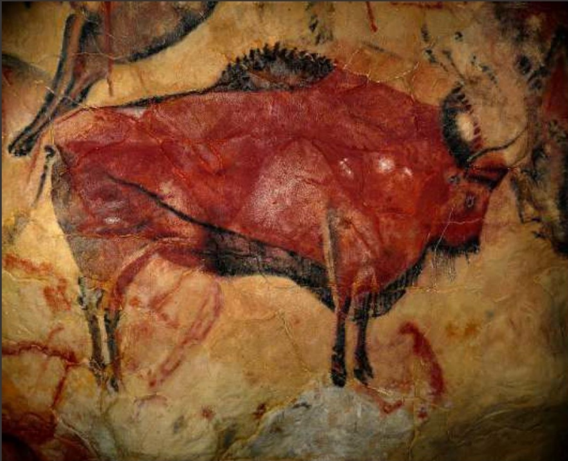
Bison depicted at the Cave of Altamira in Cantabria, Spain, dated to the Upper Paleolithic period.

A MONTHLY NEWS JOURNAL BY ARTSACRE - INTERNATIONAL CENTRE FOR CREATIVITY & CULTURAL VISION