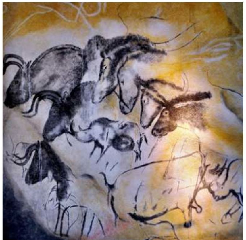
Cave Chauvet, Rhinos, Horses, Bison

reindeer in their ice-age variants, occasionally particularly detailed. This makes them - especially in the case of extinct animals - important zoological sources.