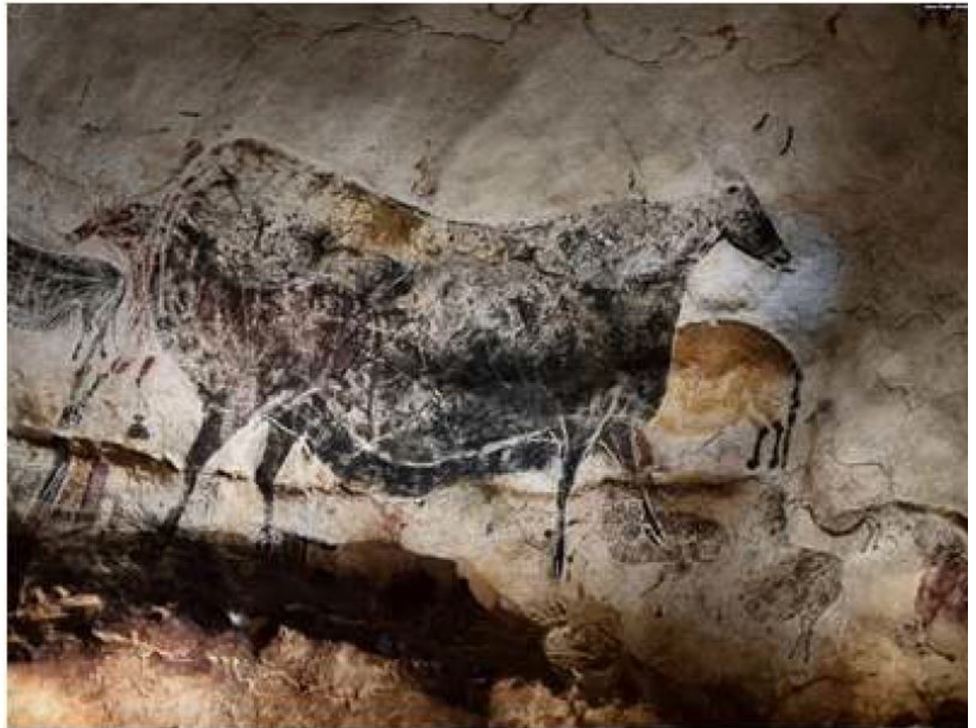
Lascaux, Black Cow, Horses

When the first cave paintings were discovered in 1868 in the Altamira Cave, near Santillana del Mar in Cantabria, northern Spain, experts initially thought they were fakes. Only after similar paintings were discovered and analysed decades later in caves of the Dordogne region (southern France), late recognition followed.