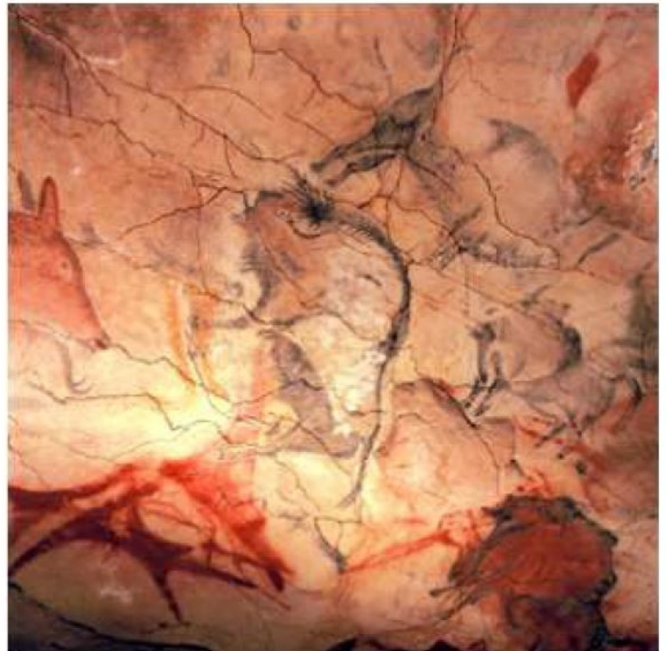
Replica Museo Altamira, Bisons and Deer

More than 350 caves with painted images are known to exist in this Franco-Cantabrian region. The cave dwellers painted with charcoal, red earth, lime or pieces of ochre, which they used in solid form like pencils or crushed as a fine powder mixed with saliva, water, animal fat or resin to make paint. They applied these colours to the walls with feathers or their fingers.