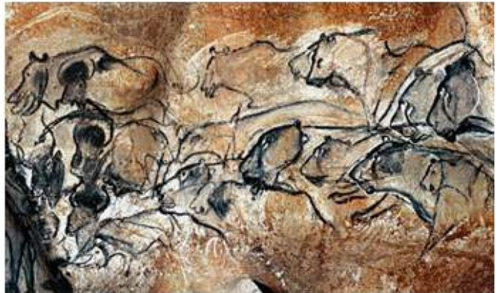
Cave Chauvet, Panel of the Lions

Together with other caves in the Franco-Cantabrian region, these three became UNESCO World Heritage Sites. Most of them have been occupied for thousands of years and have been repainted again and again. Thanks to favourable atmospheric conditions in the often huge caves, these works have been preserved for us. Stone Age people left behind “prehistoric art museums”.