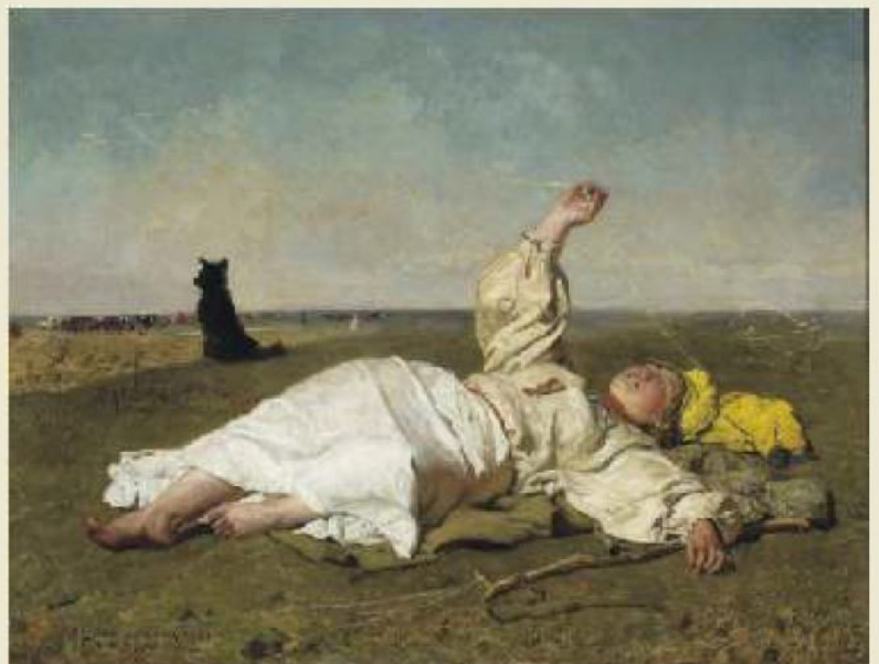
Józef Chelmonski, Altweibersommer , 1875, National Museum Warsaw

Jacek Malczewski (1854-1929) is one of the most outstanding artists of a new generation. He stands for the transition of artistic engagement with the historical past to new subjects and ways of expression. The young Poles in the European centres of the visual arts were reorienting themselves. In Munich, they turned to the realism of Munich art and created paintings of various themes, still including battle scenes like Józef Brandt (1841-1915) or Maksymilian Gierymski (1846-1874) and historicising genre scenes like Władysław Czachórski (1850-1911). Increasingly, however, daily life motifs from small towns and villages came to dominate. Cloudy or nocturnal landscapes evoking a mood of sadness and melancholy became a speciality of the "Munich Polish School". Its main representative, Maksymilian Gierymski, linked the immediate realistic rendering of nature with the painter's emotions.