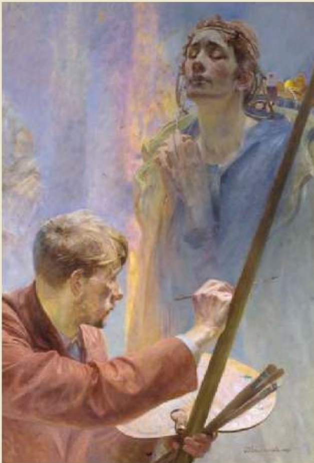
Jacek Malczewski, Artist and Muse , 1898, Private Collection

Polish presence in the Bavarian capital, which lasted about 80 years. The phenomenon of the 'Munich School' in Polish painting is firmly anchored in Poland's cultural history. This is one reason why the exhibition project of the Munich Kunsthalle has received the warm support of the Polish partners. They trust this show will have an impact far beyond Munich.