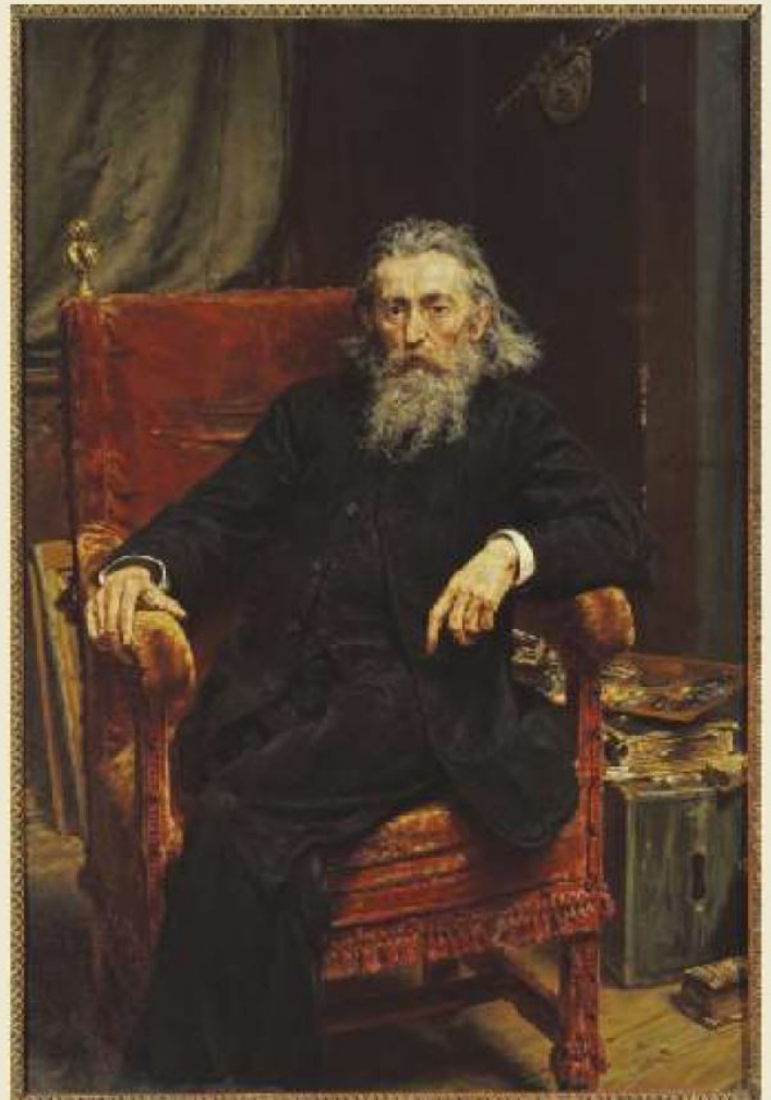
Jan Matejko, Self-portrait, 1892, National Museum of Warsaw

The Polish people did not have their own national territory at that time. Its territory was divided among the neighbouring powers of Russia to the east, Prussia to