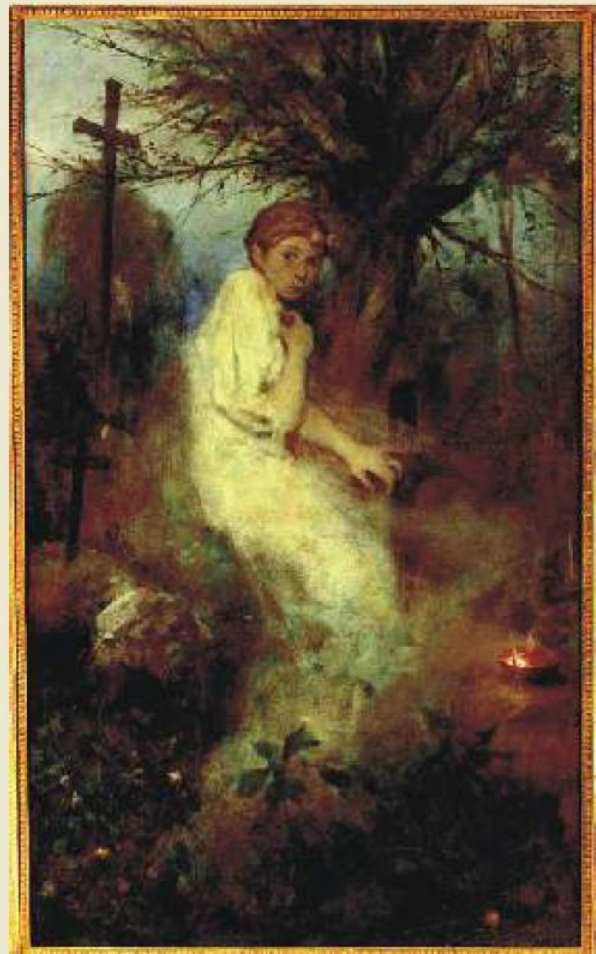
Witold Pruszkowski, All Souls' Day, 1888, National Museum Warsaw

In all the years since 1795, when Poland was split under the three neighbouring powers, the artists held the nation together in their works. It was not until 1918, at the end of the First World War, that Poland regained its sovereignty and since then has been looking with pride at the great legacy of its artists, who developed their art during a difficult century in exchange with creative circles in Munich, Paris or Vienna.