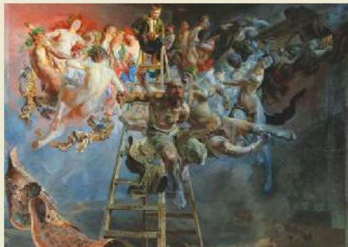
Jacek Malczewski, Vicious Circle, 1895-1897, Raczyński Foundation / National Museum of Poznan.

the west and Austria to the south. Uprisings in 1830 and 1863, against Russian rule, led to even greater repression, including the closure of the University of Warsaw in 1831 and the School of Fine Arts in 1863. Students and talents were forced to look abroad. Many went to Paris, Vienna, St. Petersburg, a large group came to Munich. Under these conditions, Munich's early internationality was mainly influenced by Eastern Europe, which waned only when conditions in the Austro-Hungarian Empire liberalised from 1867 onwards. The Polish artists, however, remained. During this period of repression in their homeland, they started to renew painting. With their works, they provided what was lacking at the political level: a new common identity. The last third of the 19th century marked the peak of