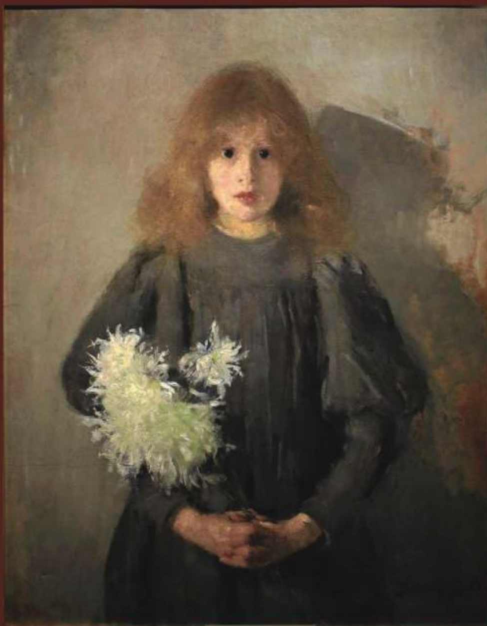
Olga Boznanska - Girl with Chrysanthemums, Oil on Canvas , 1894, National Museum Krakow

A MONTHLY NEWS JOURNAL BY ARTSACRE - INTERNATIONAL CENTRE FOR CREATIVITY & CULTURAL VISION APR 2022 Issue XXIX